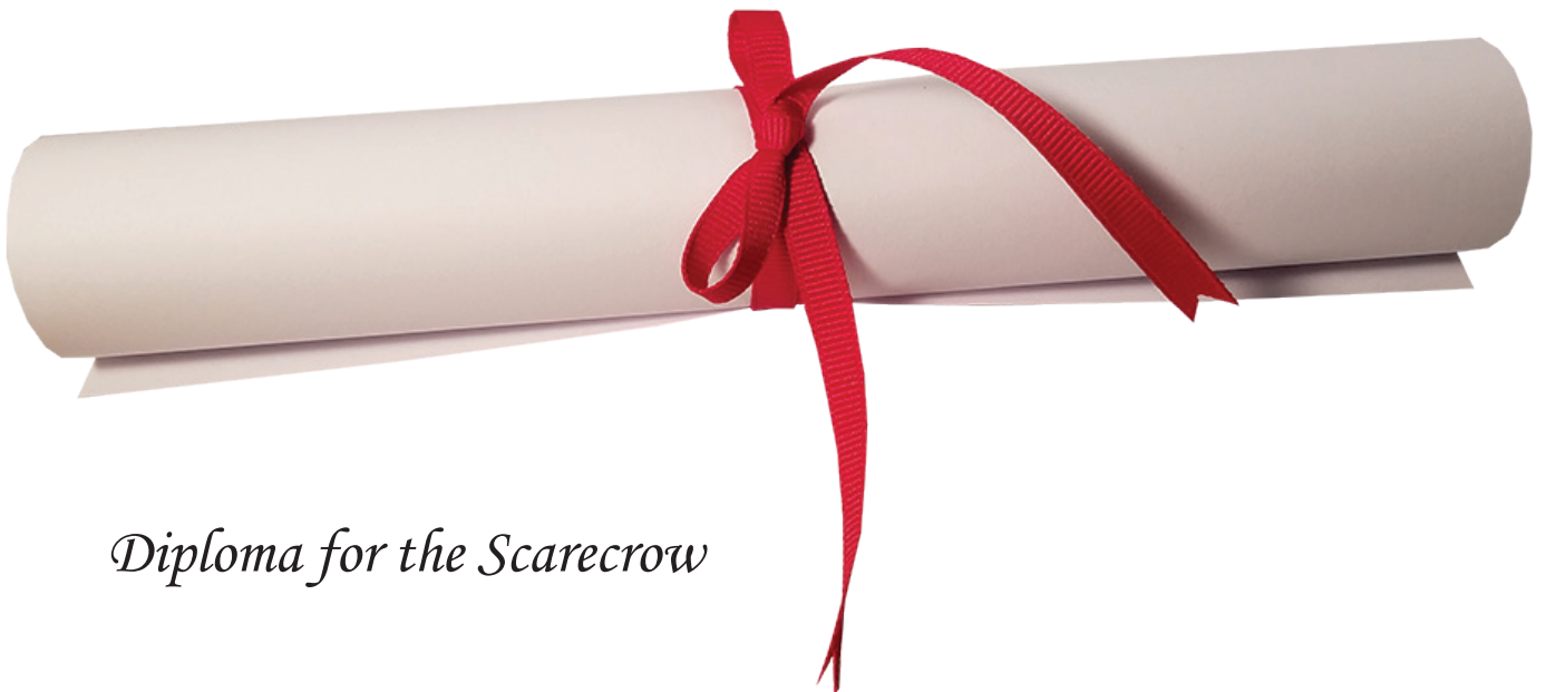
Diploma for the Scarecrow

For the medal of courage, I created the base of the top part and bottom part out of the clay that bakes to harden and then glued a ribbed ribbon over it to give it a different texture. I also glued a star pendant to the bottom of the bottom part, glued split rings between the top and bottom parts, and glued a safety pin to the back of the top part. For the diploma, I rolled a piece of paper up and tied the ribbed ribbon around it to secure it. I also cut a little triangle out of the ends of the ribbon to create the pointy ends look.