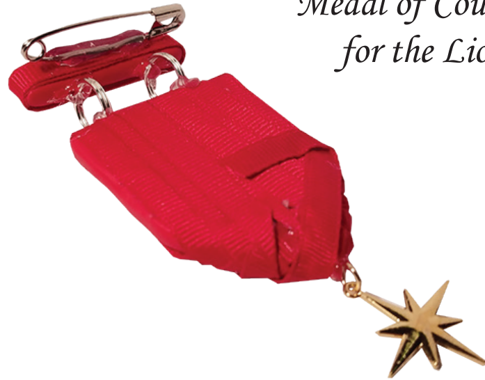
Medal of Courage for the Lion

For the medal of courage, I created the base of the top part and bottom part out of the clay that bakes to harden and then glued a ribbed ribbon over it to give it a different texture. I also glued a star pendant to the bottom of the bottom part, glued split rings between the top and bottom parts, and glued a safety pin to the back of the top part. For the diploma, I rolled a piece of paper up and tied the ribbed ribbon around it to secure it. I also cut a little triangle out of the ends of the ribbon to create the pointy ends look.